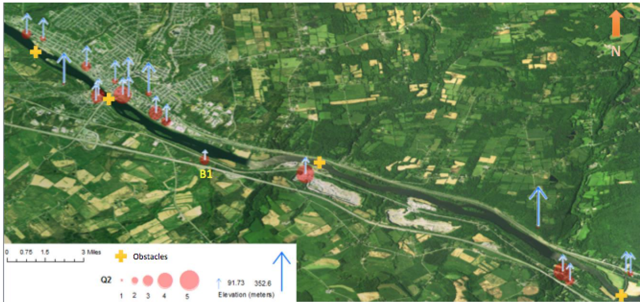
Figure 1. A GIS derived map displaying the elevation (using natural breaks classification method of ten classes ranging from 91.73 m to 352.8 m), obstacles in river such as bridges and dams, business responses to Q2 and position of business locality from the Mohawk River in Amsterdam, NY (background image was obtained from US National map Imaginary (NAIP; 1 ft. resolution). Areas located upstream from obstacles show high chance of being flooded (according to local survey responses) whereas downstream areas show low chance of being flooded. B1 shows an ideal location for a business situated between two obstacles (see text for discussion).