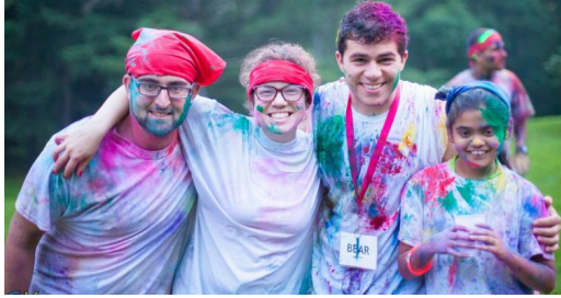
Camp Kesem Stony Brook is run by student volunteers and serves campers ages 6 to 16.

Annual Charity Dinner on Friday, March 31, at the Hilton Garden Inn Stony Brook from 7 pm to 10 pm.