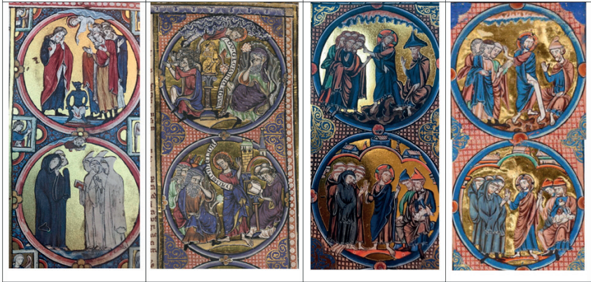
Figure 4.5. Side-by-side comparison of the Ill Kings 19. 18 biblical and commentary roundels in the four thirteenth-century exemplars.

them boni ; Oxford corrects the count to the biblical seven thousand but follows ÖNB cod. 1179 in calling them probi . 7