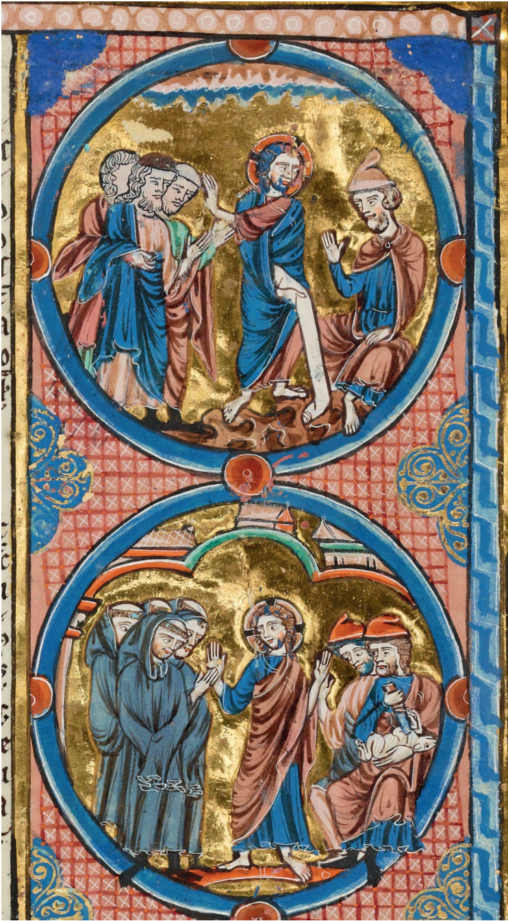
Figure 4.4. Oxford, Bodleian Library, MS Bodley 270b, 170Cc.