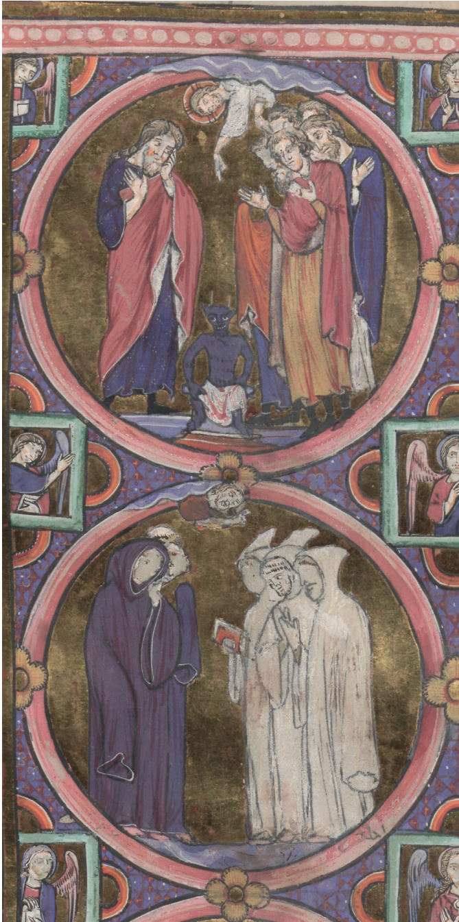
Figure 4.1. Vienna, Österreichische Nationalbibliothek (ÖNB) MS 2554, 54vAa.