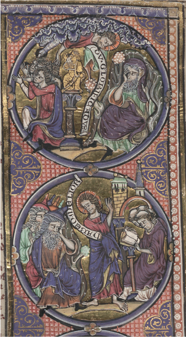
Figure 4.2. Vienna, Österreichische Nationalbibliothek (ÖNB) MS 1179, 122Cc.