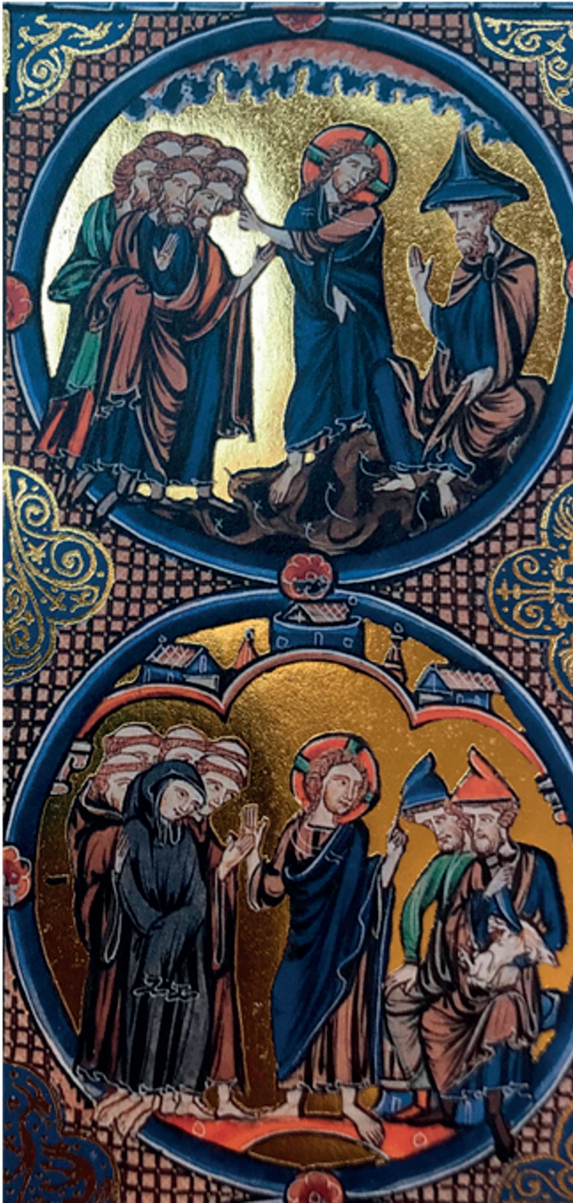
Figure 4.3. Toledo, Cathedral of Toledo, Bible moralisée (Biblia de San Luis), vol. 1, 138Cc.